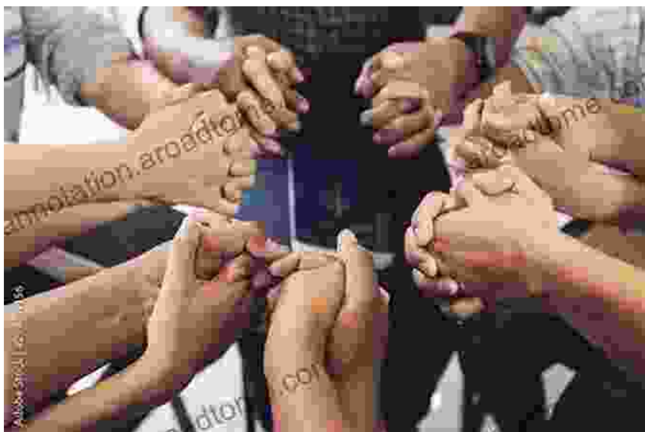
The Power of Community Prayer