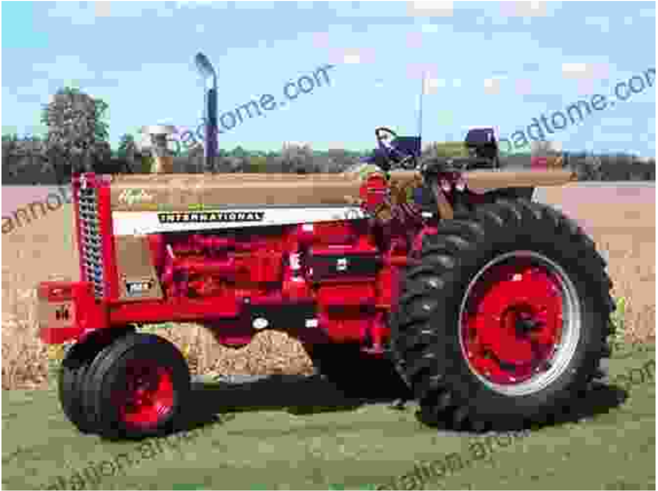
An early International Harvester Farmall tractor